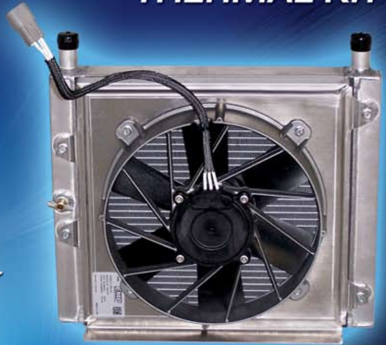
TK 1 THERMAL KIT