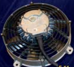
F-11 ELECTRIC FAN