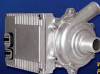
WP29 WATER PUMP (OPTIONAL)